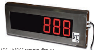
MDS | MDSS remote display