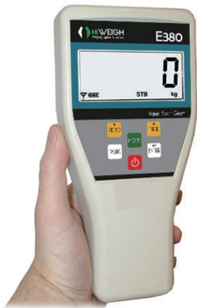
E380 Palm Indicator