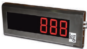
MDS | MDSS remote display