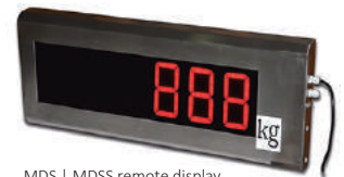
MDS | MDSS remote display