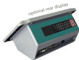
optional rear display