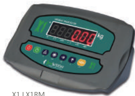
X1 | X1RM