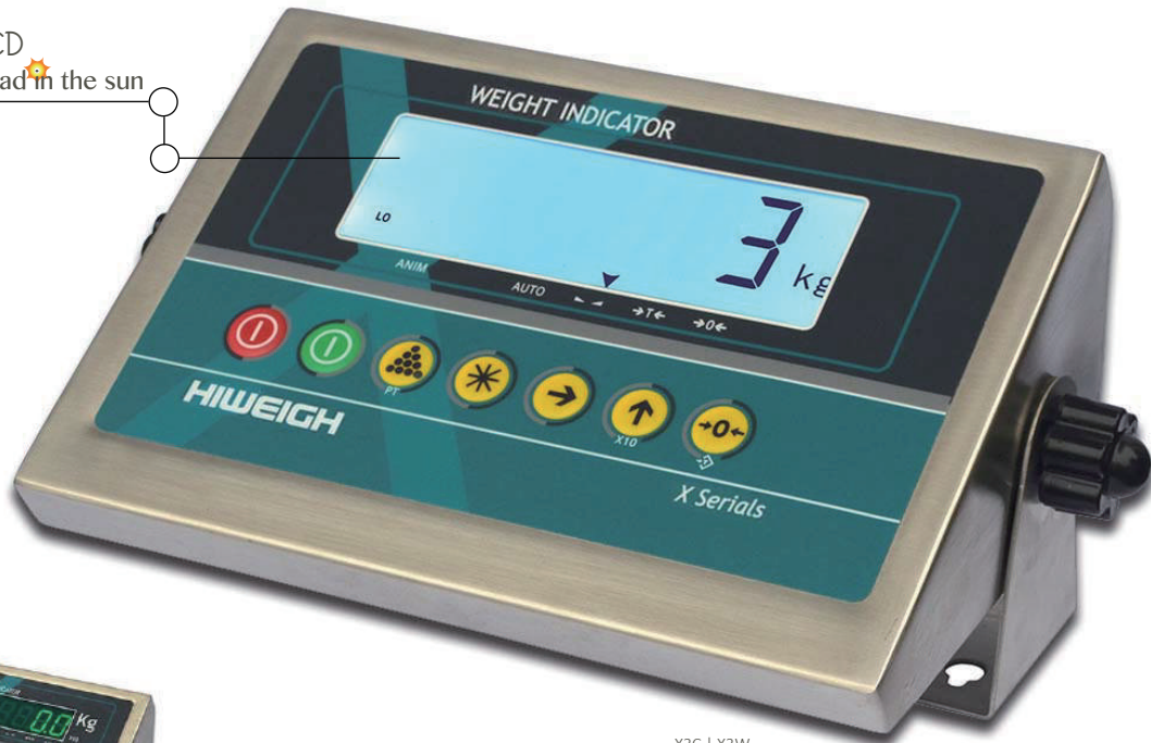
X3C | X3W