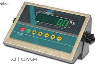
X3 | X3WGM