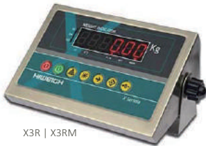
X3R | X3RM