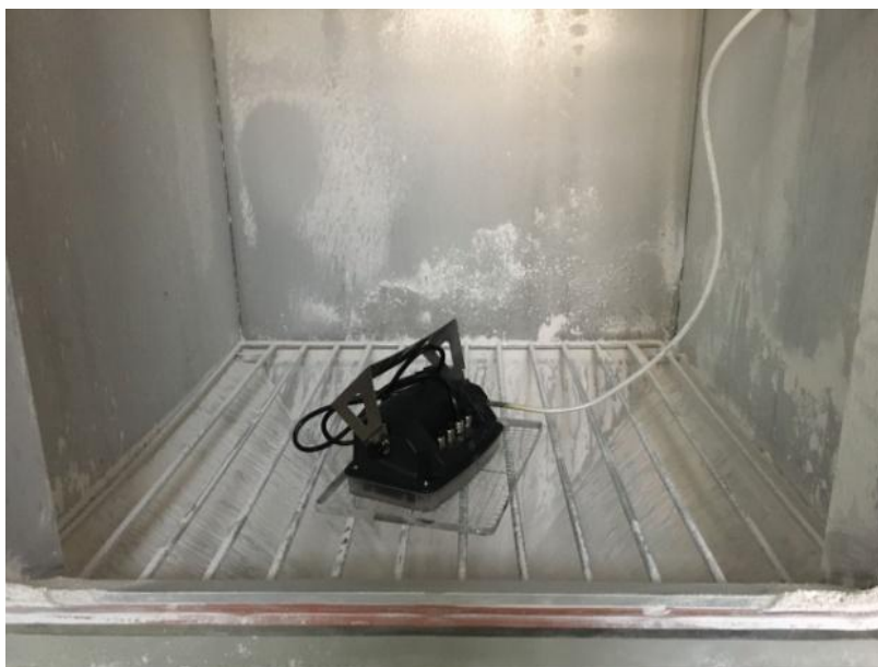
Test set-up photos