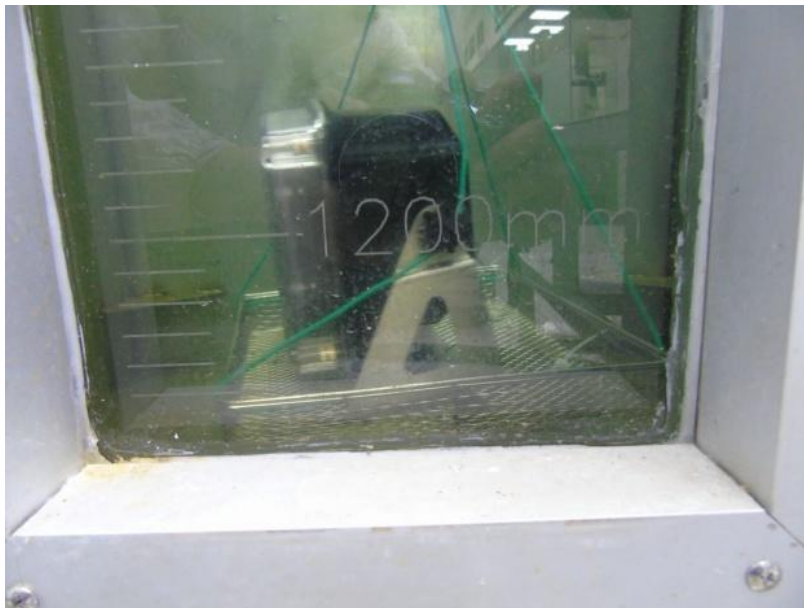
Test set-up photos